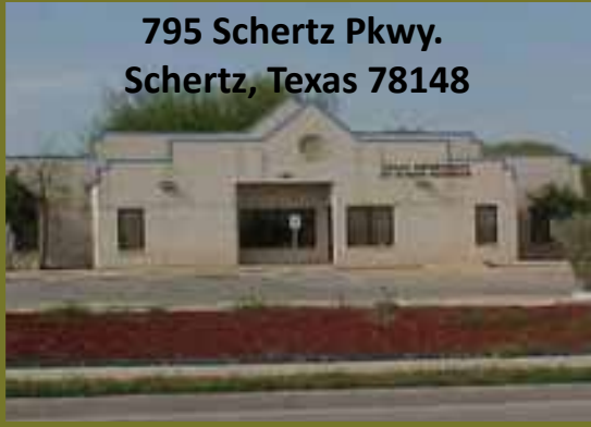
795 Schertz Pkwy. Schertz, Texas 78148