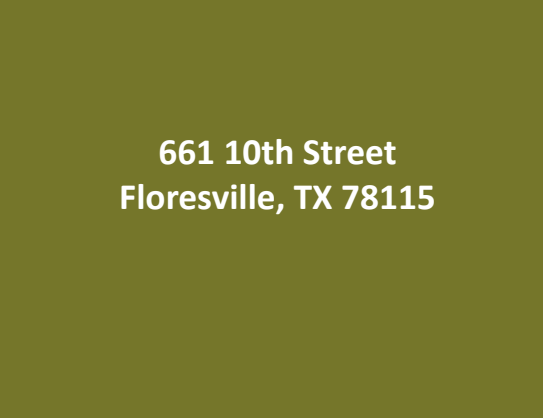
661 10th Street Floresville, TX 78115