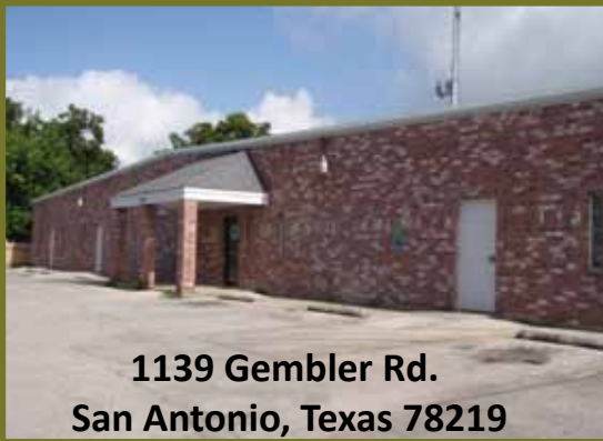
1139 Gemblar Rd. San Antonio, Texas 78219