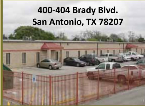
400-404 Brady Blvd. San Antonio, TX 78207